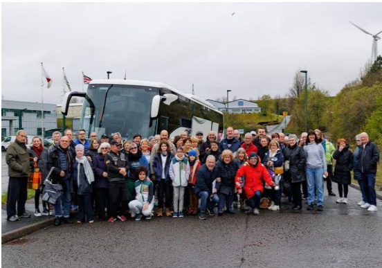
Twinning visit – 1 st - 5 th June, 2023

As part of the Twinning partnership with Orvault, France, Town Council Members and Twinning representatives undertook a visit to Orvault, France. The trip went very well and proved a success in engaging with Council’s French counterparts.