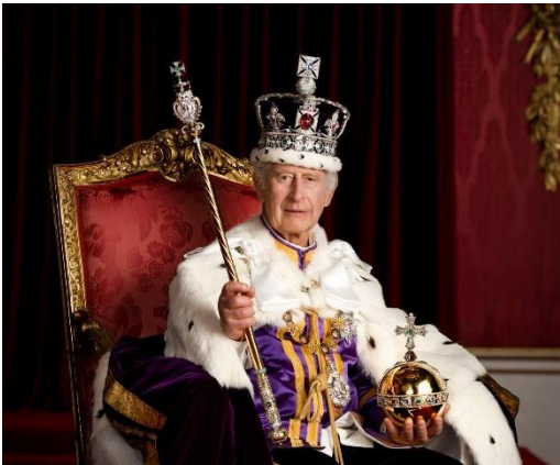
Coronation Celebrations– His Majesty King Charles III – 6 th - 8 th May, 2023

Highlights of the Council’s activities and achievements from 1 st April, 2023 up to 31 st March, 2024, entailed: